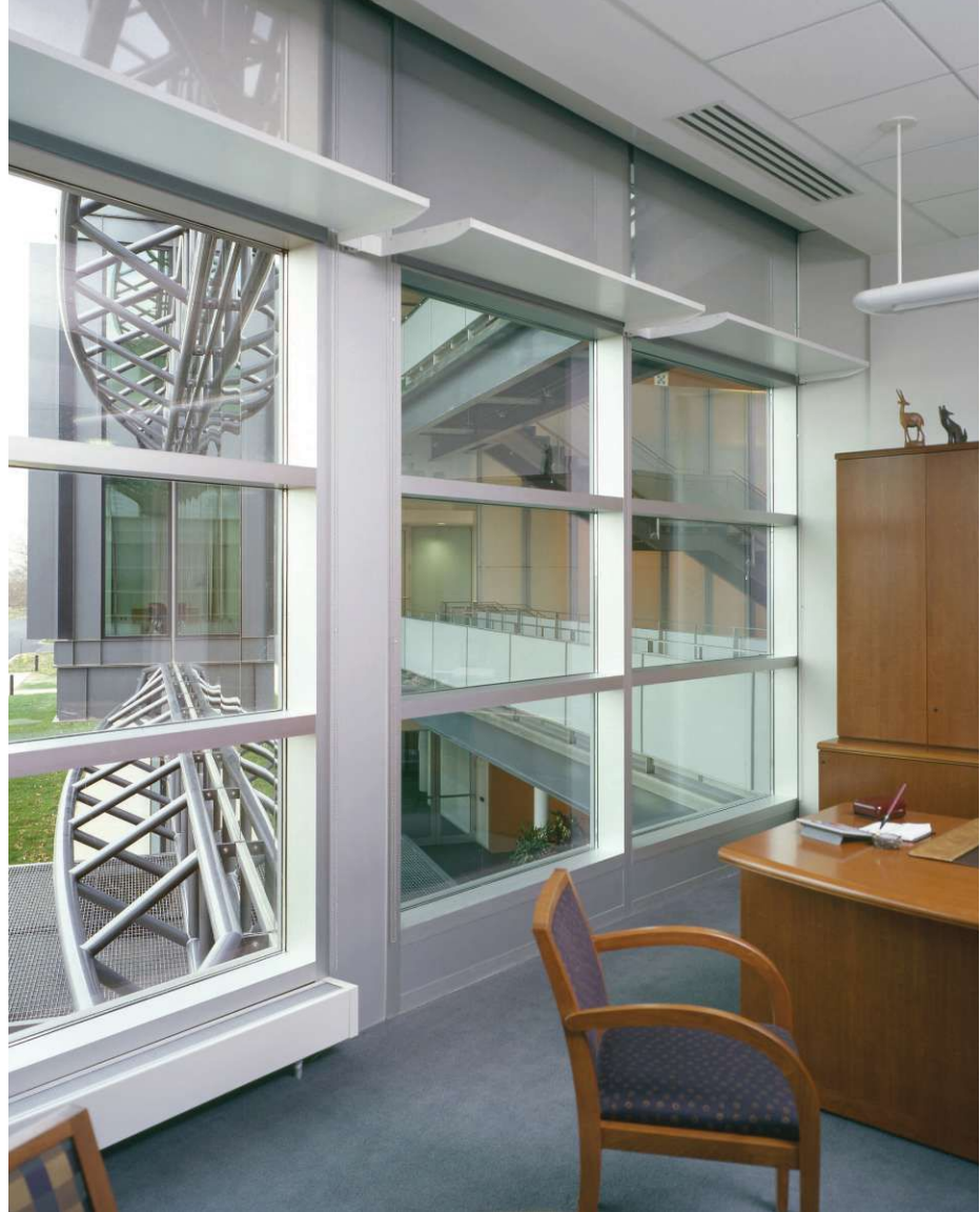
Light shelves, which can increase penetration to 2.0 times head height, are located beneath clerestory windows to help bounce light into the Armstrong World Industries’ LEED Platinum HQ in Lancaster, Pa.

7. Make sure the building program relates to natural daylighting. Make access to daylight a factor when laying out floor plans and designing perimeter spaces. “Everyone loves a window office